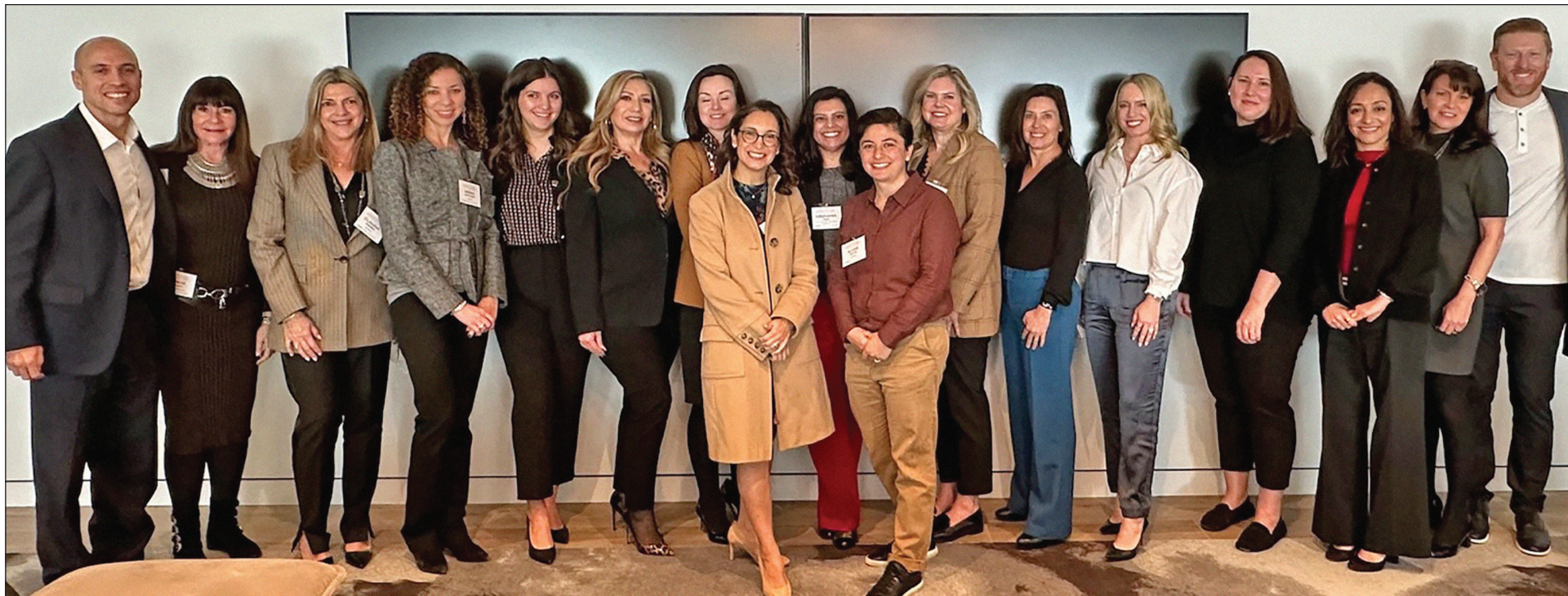
San Diego Business Journal's 2022 Business Women of the Year winners and JPMorgan Chase executives gathered at the bank's One Paseo office on Jan. 18 to share insights and ideas on how speaking up plays in advancing careers of women.