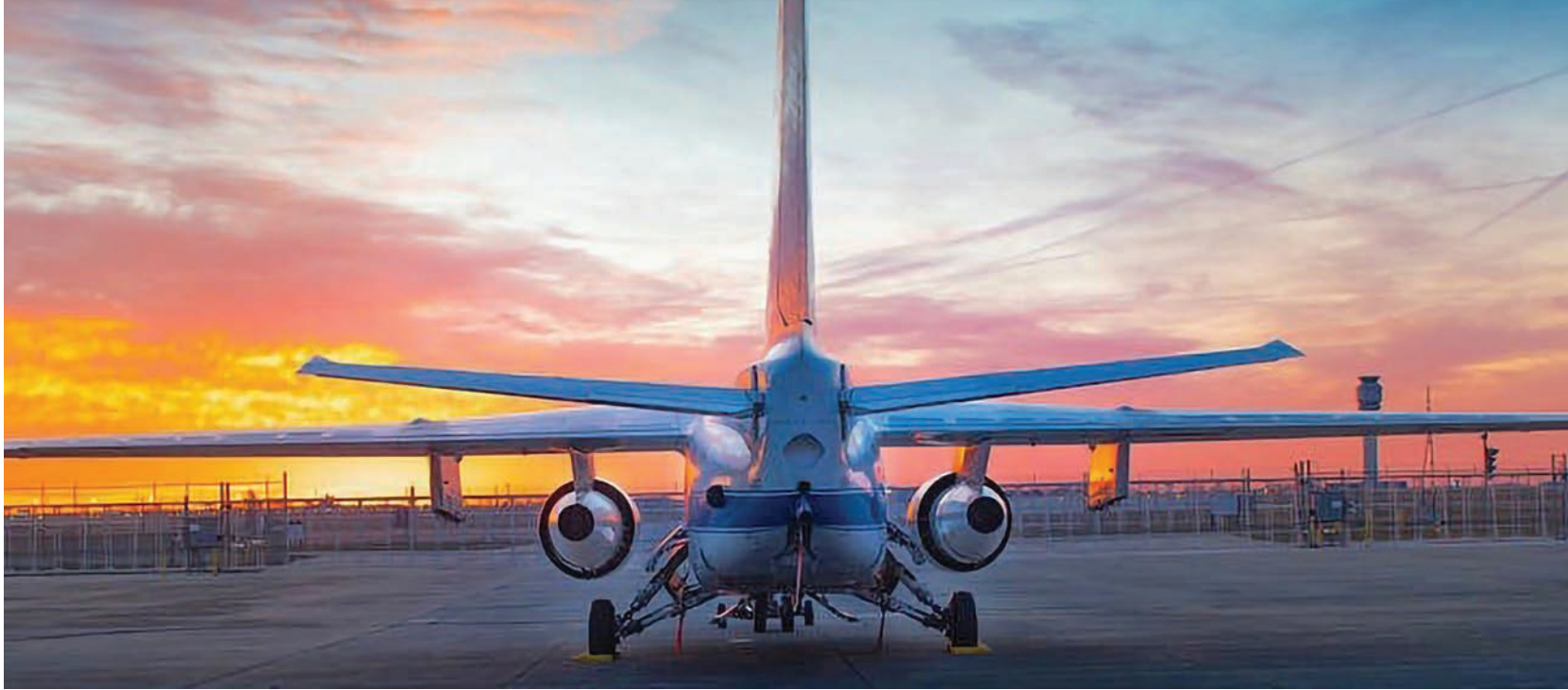
The S-3B Viking