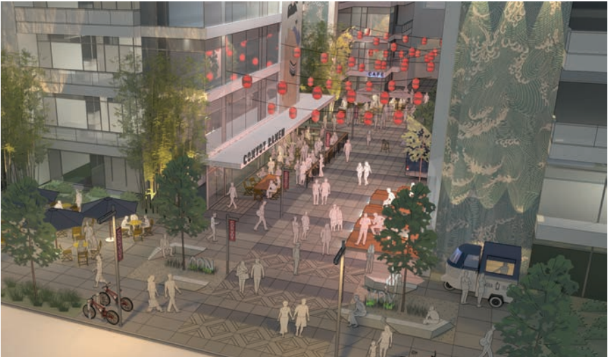
Conceptual mid-block paseo design along the Convoy Corridor incorporating pedestrian-oriented design features, active frontages and serving as a cultural gathering place for the community.

Kearny Mesa has all the components necessary to become one of San Diego’s biggest revitalization success stories. While its culturally diverse bars and restaurants already have lines out the door, expect to see people lining up for the opportunity to live there soon.