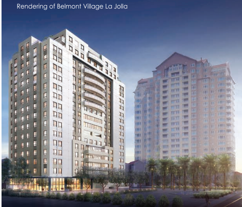
Rendering of Belmont Village La Jolla

The units offered will be studio, one and two-bedroom residences.