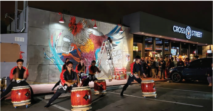
Taiko drummers Asayake Taiko entertain the crowd at the unveiling of the Cross Street Chicken & Beer mural in the Convoy District.