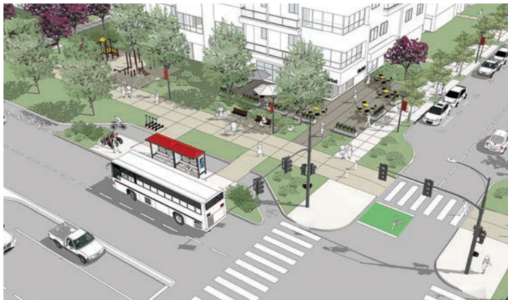
As envisioned by the community plan update, Aero Drive Village is planned as a mixed-use neighborhood linked by multimodal connections and the Aero Promenade to the Convoy Corridor at the west end and StoneCrest neighborhood and retail center at the east end.

If you could wave a magic wand and make a big dent in San Diego's housing shortage by adding 26,000 new homes, where would you do it?