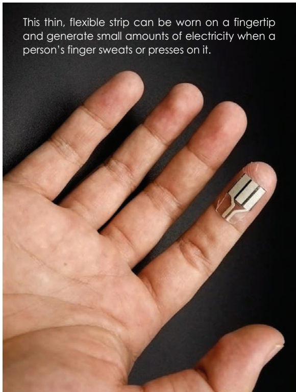
This thin, flexible strip can be worn on a fingertip and generate small amounts of electricity when a person's finger sweats or presses on it.

The device also generates extra power from light finger presses—so activities such as typing, texting, playing the piano or tapping in Morse code can also become sources of energy.