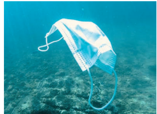
Disposable face mask in the ocean

These masks are commonly made of polypropylene, which easily breaks up into microplastics. While the effects of microplastics on human health are not yet determined, these fragments are incredibly common in our water supply— for example, 94 percent of U.S. tap water is deemed to be contaminated.