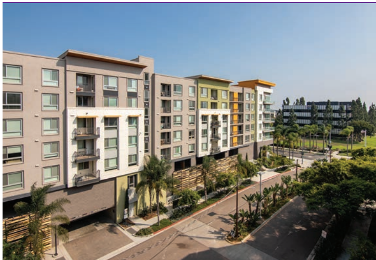
Traffic-calming medians and landscaping along Spectrum Center Boulevard improve the pedestrian experience in Kearny Mesa.