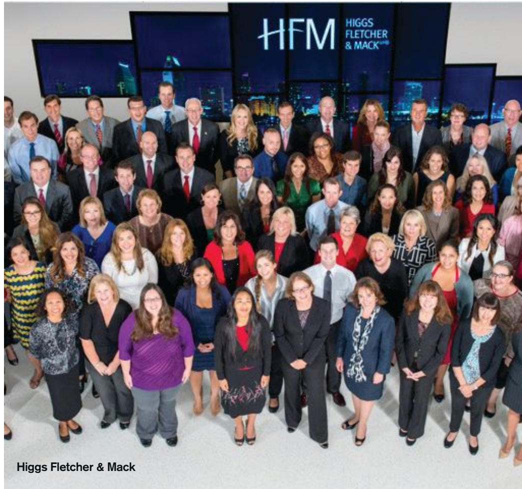
Higgs Fletcher & Mack