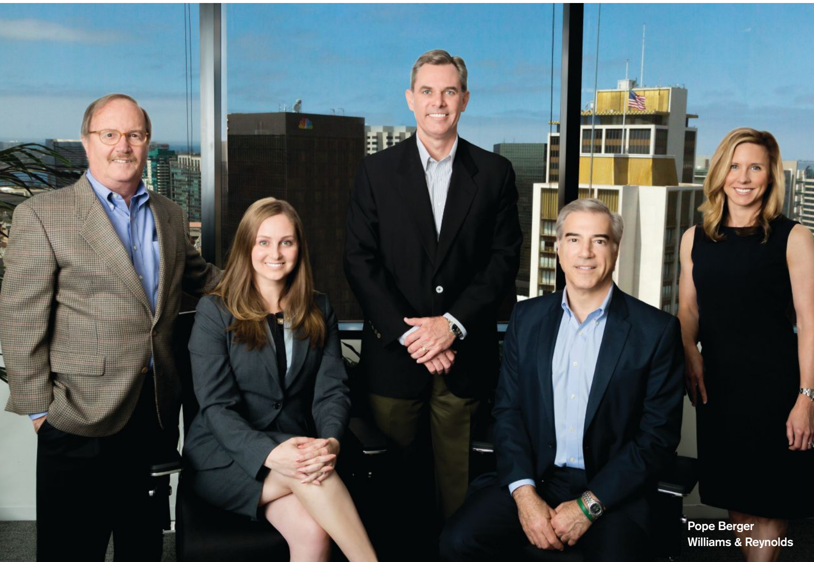
Pope Berger Williams & Reynolds